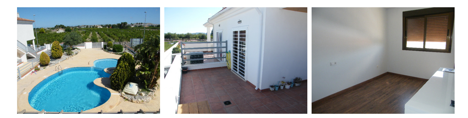
Important Notice: These details have been produced in good faith and are believed to be accurate based upon the information supplied but they are not intended to form part of a contract. You are strongly advised to check the availability of the property before travelling any distance to view. Any intending purchasers must satisfy themselves by inspection or otherwise as to the correctness of each of the statements contained in these particulars.

This very modern property is very nicely situated in a gated complex set around well-maintained communal areas with pool. Only a short walk into the village. The spacious living area is set over the first floor and comprises; 2 bedrooms, 2 bathrooms (1 en-suite), lounge/dining area and independent kitchen. Outside is a lovely 30 m2 wrap-around terrace. Included with this purchase is a 50 m2 basement, suitable for a variety of uses and ground-floor outside space with parking. There's pre-installation for ducted air-conditioning and hard wood floors throughout. An exceptional property, well worth viewing.