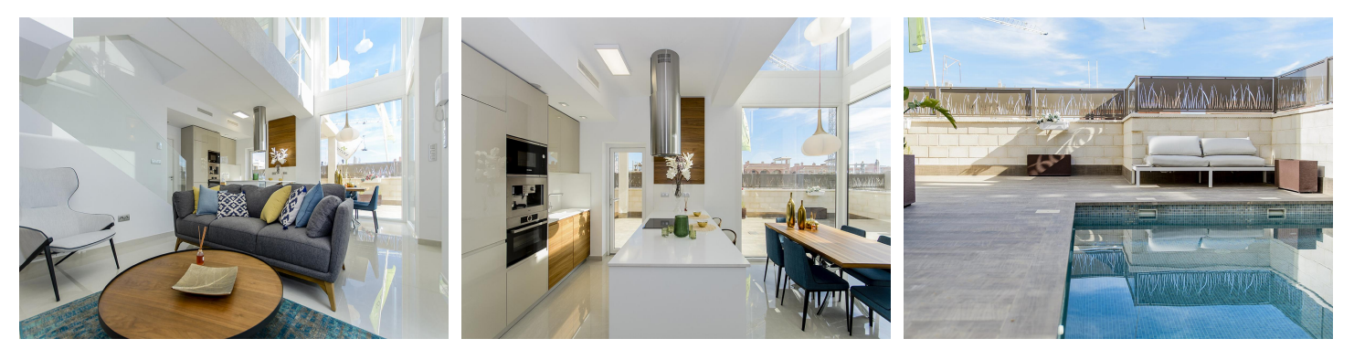
Important Notice: These details have been produced in good faith and are believed to be accurate based upon the information supplied but they are not intended to form part of a contract. You are strongly advised to check the availability of the property before travelling any distance to view. Any intending purchasers must satisfy themselves by inspection or otherwise as to the correctness of each of the statements contained in these particulars.