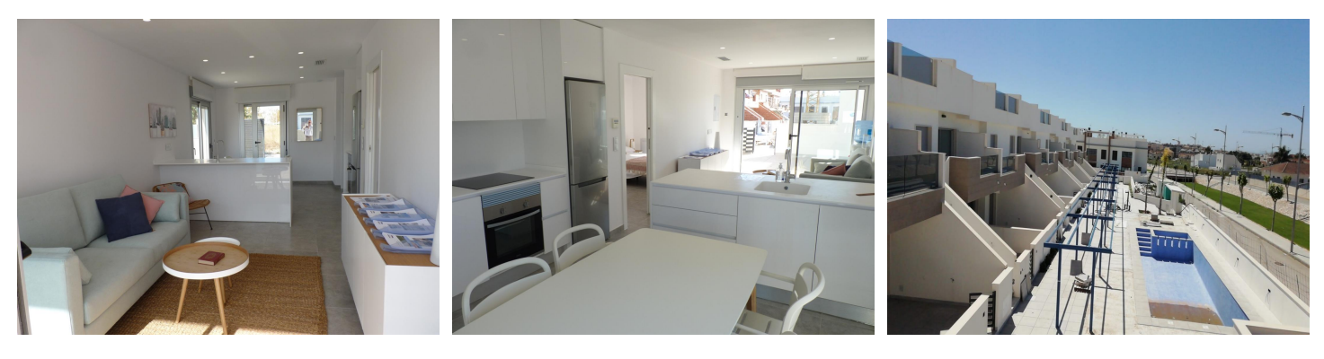
Important Notice: These details have been produced in good faith and are believed to be accurate based upon the information supplied but they are not intended to form part of a contract. You are strongly advised to check the availability of the property before travelling any distance to view. Any intending purchasers must satisfy themselves by inspection or otherwise as to the correctness of each of the statements contained in these particulars.