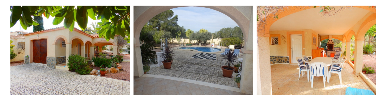
Important Notice: These details have been produced in good faith and are believed to be accurate based upon the information supplied but they are not intended to form part of a contract. You are strongly advised to check the availability of the property before travelling any distance to view. Any intending purchasers must satisfy themselves by inspection or otherwise as to the correctness of each of the statements contained in these particulars.

Las Comunicaciones, It's a delight to bring onto the market for sale this superior 328 m<sup>2</sup> detached villa distributed over three levels.Large 2220 m<sup>2</sup> corner plot mostly gravelled, 2 garages, pool house with wc, shower and changing area and room for sauna, pool side BBQ and covered terrace.. Ground floor, garage, separate apartment with 2 beds, 1 bathroom, independent kitchen (both master bed and lounge onto to large curved covered terrace. Upstairs main accommodation has access from main door and stairs down to garden from terrace, Kitchen/diner, large lounge with wood burner 3 beds 2 bath, master has large wardrobe area, huge master bath with hydro-shower and separate spa bath and WC, direct access to upper curved covered terrace with spectacular views. Third floor with 1 bed, 1 shower room with solarium.The main villa has special under-floor heating and cooling system.In addition to the general furniture, there's a large Canadian redwood bar set for negotiation. Incredible views.