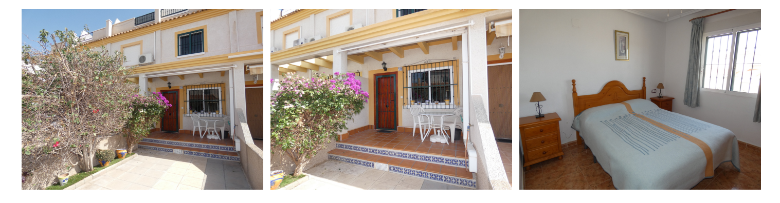
Important Notice: These details have been produced in good faith and are believed to be accurate based upon the information supplied but they are not intended to form part of a contract. You are strongly advised to check the availability of the property before travelling any distance to view. Any intending purchasers must satisfy themselves by inspection or otherwise as to the correctness of each of the statements contained in these particulars.

Take a look at this fantastic Townhouse on the desired Urbanisation of Montemar, part of Algorfa, in the Costa Blanca South Region. A very popular area due to its fantastic amenities at such close proximity and 5* La Finca Golf Resort just across the way. The property has a private front terrace with enough space for off-road parking, and an elevated seating area. As you enter the property you have the living room with a separate kitchen area and a downstairs bathroom. Upstairs you have the two double bedrooms with family the bathroom, and on the top floor you have a split solarium with an outside shower, where you can soak the sun up all day long! You have the beautiful communal pool just around the corner. You are a short walk from The Algorfa Hotel, which has live entertainment and events every week, as well as a local bakery and convenient store for your fresh goods. You are in walking distance to the La Finca commercial centre which has a selection of bars and restaurants to choose from. Only 15 minutes to the lovely sandy beaches of Guardamar & only a 35 minute drive to Alicante Airport.