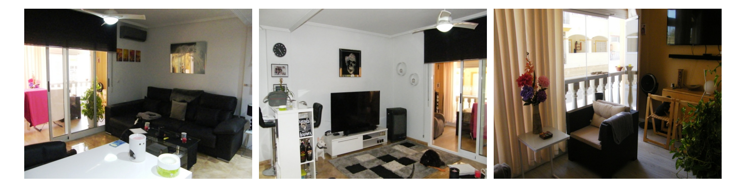
Important Notice: These details have been produced in good faith and are believed to be accurate based upon the information supplied but they are not intended to form part of a contract. You are strongly advised to check the availability of the property before travelling any distance to view. Any intending purchasers must satisfy themselves by inspection or otherwise as to the correctness of each of the statements contained in these particulars.

An incredibly spacious 2 bedroom, 2 bathroom (1 en-suite) modern property, within easy reach of all amenities. The beautifully finished and maintained development has disabled access, 2 elevators, communal roof-top pool, solarium with breathtaking views & intercom access. This immaculately kept ground floor property has been carefully designed giving access to the bedrooms & bathrooms from a long hallway. Allowing for the living area (lounge, kitchen & 10 m2 covered terrace which has tastefully been enclosed using glass curtains to be completely separate from the sleeping, bathing and utility areas. There is also an underground parking space and patio/utility with this property. This property represents incredibly good value and must be viewed to be fully appreciated.