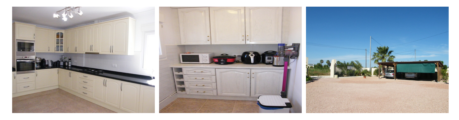
Important Notice: These details have been produced in good faith and are believed to be accurate based upon the information supplied but they are not intended to form part of a contract. You are strongly advised to check the availability of the property before travelling any distance to view. Any intending purchasers must satisfy themselves by inspection or otherwise as to the correctness of each of the statements contained in these particulars.

This south-facing luxury villa has been designed and finished to a standard way and beyond that of similar detached properties currently available in the area. Three of the four double bedrooms come with en-suite bathroom, there's a bright and elevated hallway leading off from are; the lounge, separate dining room, independent kitchen + utility, bedrooms, family bathroom and storage room. The glazed porch overlooks the terraced pool area, orientated to enjoy all day sunshine. Alongside, there's a large summer kitchen with covered dining area. This luxury property has been built for long-term living and those serious about entertaining. Viewing essential!