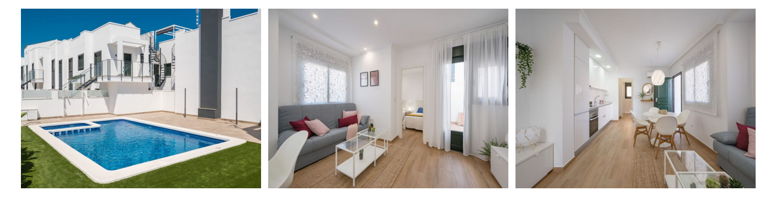
Important Notice: These details have been produced in good faith and are believed to be accurate based upon the information supplied but they are not intended to form part of a contract. You are strongly advised to check the availability of the property before travelling any distance to view. Any intending purchasers must satisfy themselves by inspection or otherwise as to the correctness of each of the statements contained in these particulars.

A Key Ready 3 bed 2 bath top floor apartment with a private rooftop solarium located in Marco Polo, La Zenia, Costa Blanca. This lovely key ready, fully furnished property very briefly consists of the following Lounge / diner, open plan fully fitted kitchen, 3 x double bedrooms with fitted wardrobes, the main bedroom has en suite shower room, 1 x shower room, private roof top solarium, communal swimming pool, underground parking space, fully furnished with hot and cold A/C all included in the price. Just 10/15 minutes walk to the beach, 5 minutes walk to all amenities & a few minutes by car to Zenia Boulevard shopping mall and 7 minute drive to Villamartin golf course.