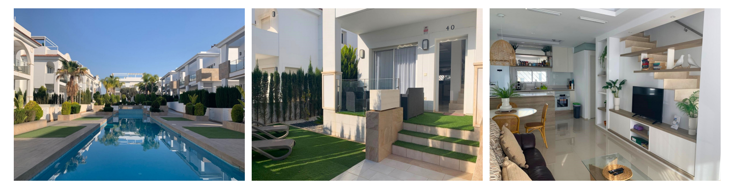
Important Notice: These details have been produced in good faith and are believed to be accurate based upon the information supplied but they are not intended to form part of a contract. You are strongly advised to check the availability of the property before travelling any distance to view. Any intending purchasers must satisfy themselves by inspection or otherwise as to the correctness of each of the statements contained in these particulars.