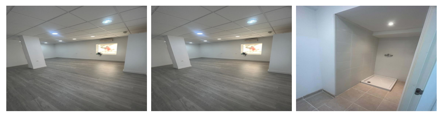
Important Notice: These details have been produced in good faith and are believed to be accurate based upon the information supplied but they are not intended to form part of a contract. You are strongly advised to check the availability of the property before travelling any distance to view. Any intending purchasers must satisfy themselves by inspection or otherwise as to the correctness of each of the statements contained in these particulars.